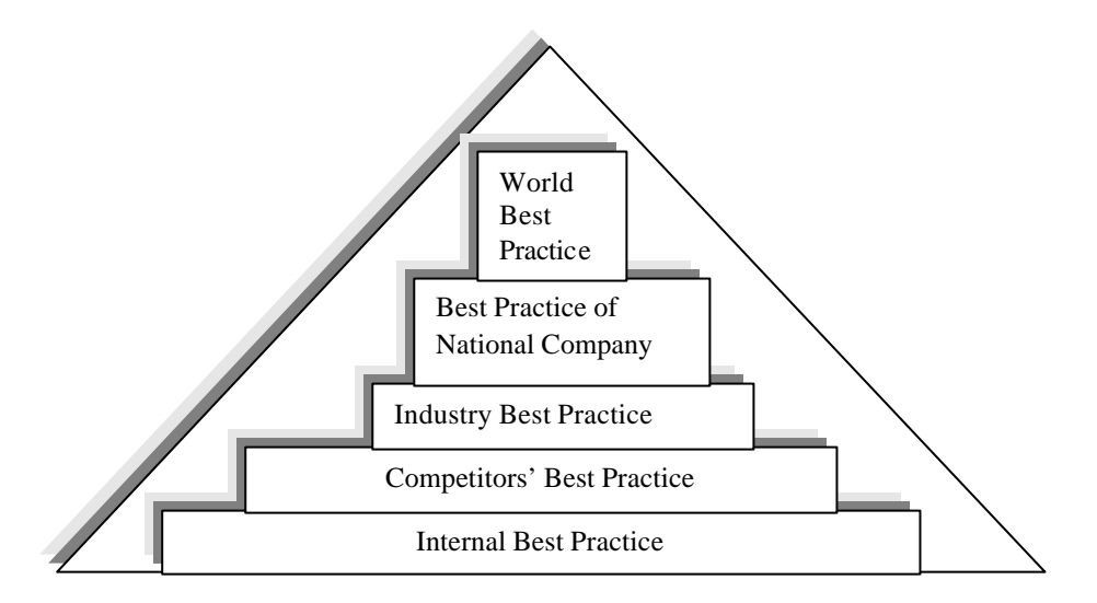
Figure 1. Types of Benchmarking: The Analysis Pyramid (Kasilingam, 1995)

Types of benchmarking reflect 'what is compared' and 'whom it is compared against'. (Anderson and Pettersen, 1996). The former involves performance, process and strategic benchmarking, whilst the latter involves internal, competitive, functional and generic. (Evans, 1994) Kasilingam expands Evans grouping of 'whom it is compared against' to include industry and national best in class. (see Figure One)